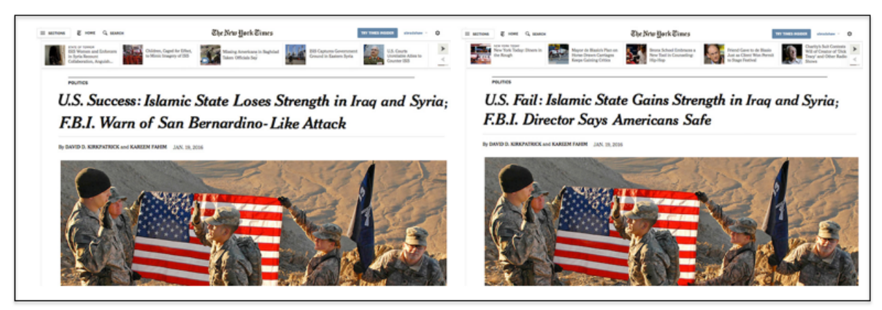
Figure 1. Examples of high threat/high strength and low threat/low strength.

State Gains Strength in Iraq and Syria; F.B.I. Director Says Americans Safe." See Figure 1. Images included depictions of American soldiers holding an American flag, and the San Bernardino shooters.