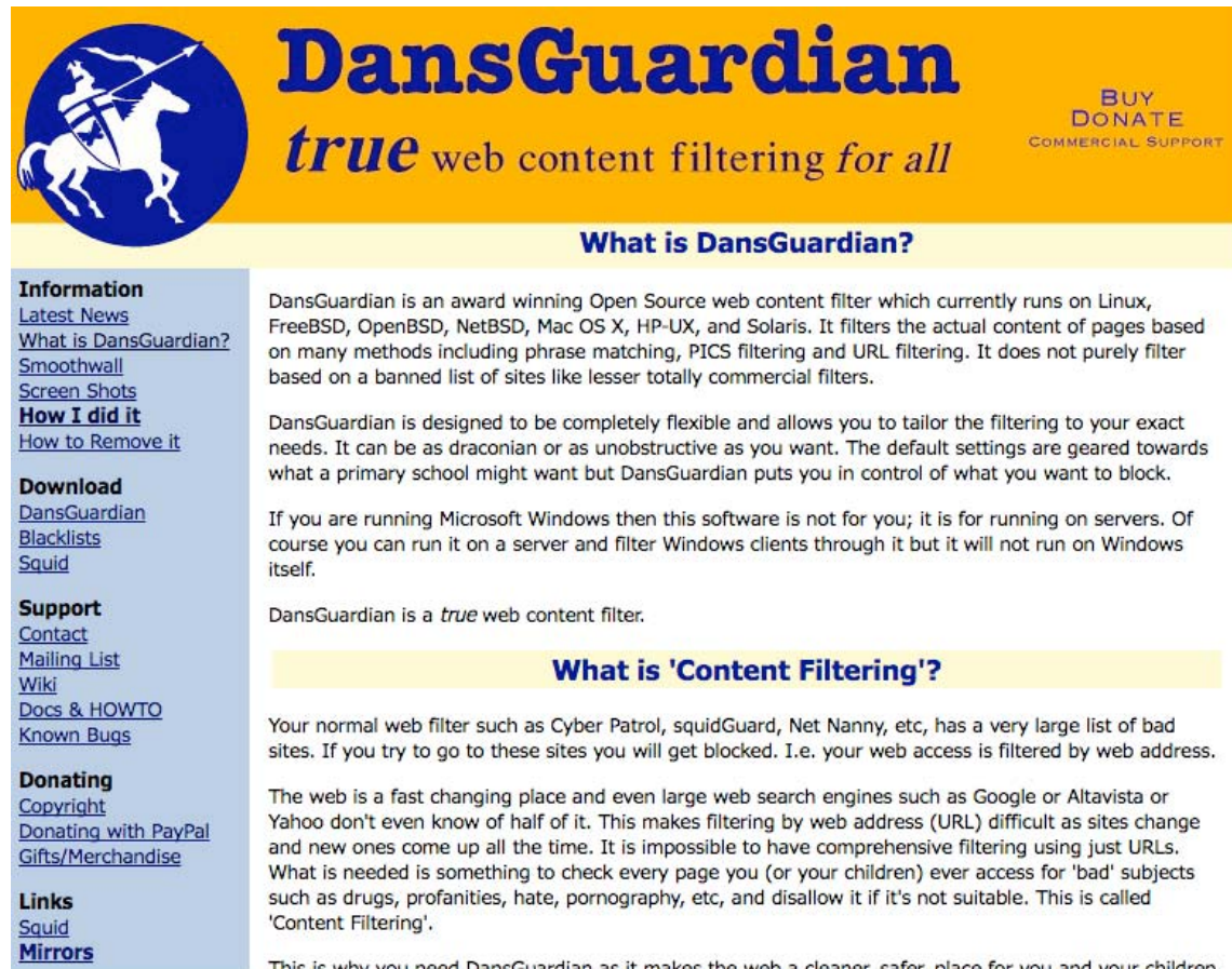
Figure 9. An explanation of DansGuardian, written by Dan.

While Dan locates filtering agency “in” his code, other providers distribute it across a network of actors. In a corporate blog post addressing CIPA compliance, a Barracuda employee assures administrators that its “preclassified” blacklist of URLs is “continuously updated by engineers at Barracuda Central and delivered hourly via the Energize Updates subscription service sold with the Barracuda Web Filter,” which can then be manipulated further by local technicians (Barry, 2015, p. 5). Indeed, the marketing materials of filtering companies at once presume and reflect the complexity of filtering systems, prescribing local administrators toggling categories populated by algorithms, coded by engineers, to meet a market opportunity induced by federal legislation, impelled by moral panics, implemented by understaffed institutions, to serve fickle patrons.