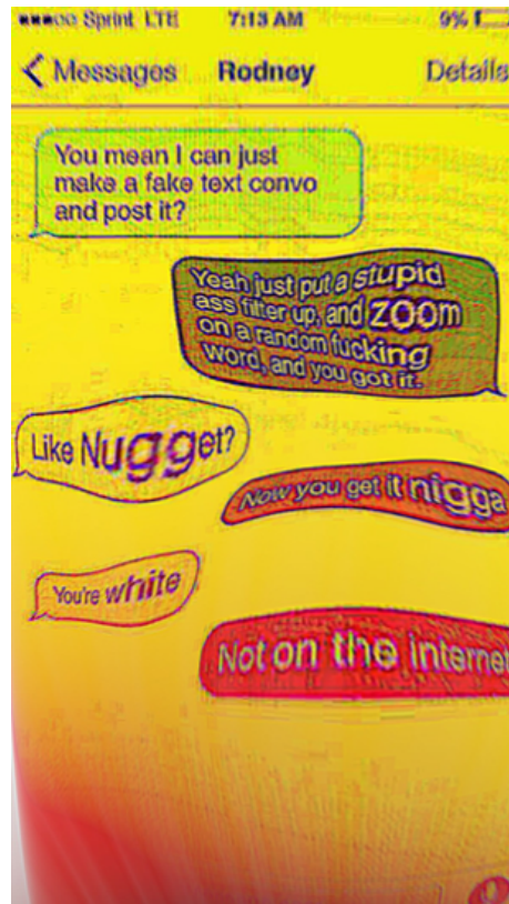
Figure 6. "Teaching my friend 'bout deep fried memes."

Because deep-frying a meme involves the intentional use of the image format to degrade the image and lower its overall quality, there is opportunity for significant control and customizability.