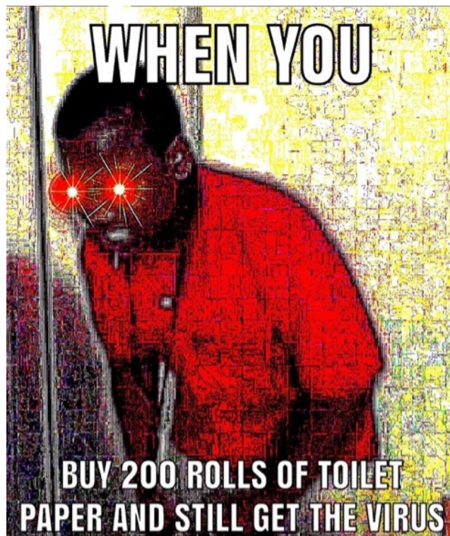
Figure 5. "bruh."

The aesthetic of haste shows how copying and remixing become materially inscribed within a digital text. This materiality emerges from both unintentional and intentional practices. While virtually all memes contain aspects of the aesthetic of haste, the overlap of intentional and unintentional image degradation is most apparent in "deep-fried memes." These are meme instances with exaggerated low image resolutions, color filters, and general degradation of the overall quality.