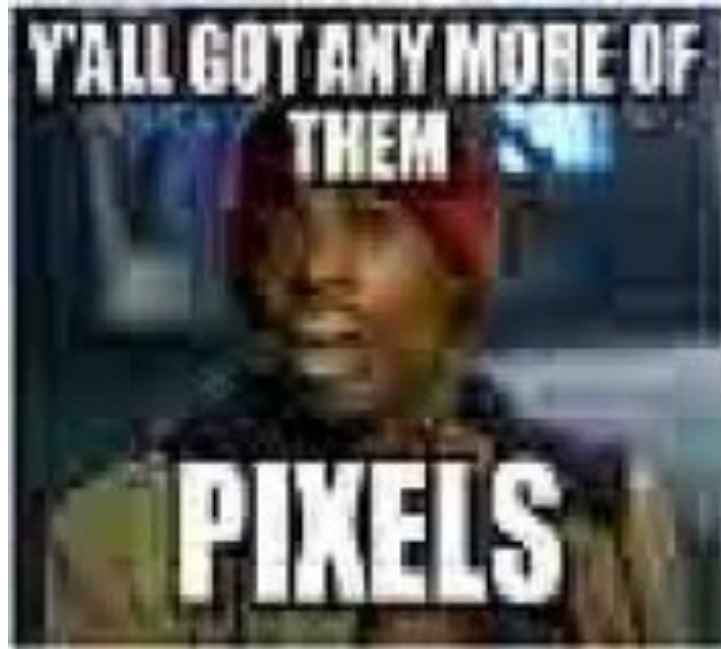
Figure 1. "Y'all got any more of them pixels."

exists solely to spotlight instances of overly compressed images demonstrates not only the hyper-specific nature of online communication but also the general awareness and acceptance of such image compression artifacts. Users here are not clamoring for the widespread adoption of higher-fidelity image formats. Instead, they are merely acknowledging, perhaps even celebrating, the material traces of copying in digital texts.