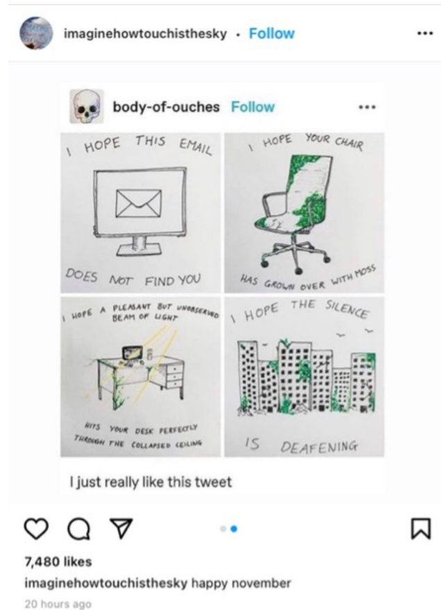
Figure 4. "I just really like this tweet."

The text contained within the screenshot of the Tumblr post directly acknowledges Twitter as its origin, which directly describes the line's move from one platform to another. The appearance of the Tumblr interface—identifiable by the squared edges on the profile picture—alongside the Instagram interface—identifiable by the circular profile picture—are examples of the aesthetic of haste and further underscore the meme's circulation across online spaces.