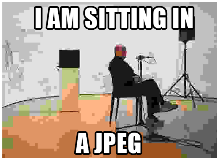
Figure 9. "Alvin Lucier needs more JPEG." Meme instance created by the author.

I opened this article with a portion of Alvin Lucier's (1981) "I'm sitting in a room" performance, a demonstration of how continual cycles of recording and rerecording leave their trace within the media object itself. After nearly an hour of this process, Lucier's (1981) recording was left virtually unrecognizable. The aesthetic of haste, as I have described here, demonstrates how the same process can occur online. Internet memes are a form of new media that remediates the logics of prior formats (Bolter & Grusin, 2003). Just as the magnetic surface of audiotapes and videotapes would gradually degrade as the tape passed through its respective playback devices, Internet memes can similarly "break down" each time they are copied, shared, and remixed. Memes can, as Nick Douglas (2014) describes, "look like shit" (p. 314) but still be meaningful for community formation.