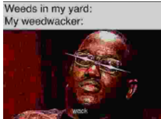
Figure 7. "W A C K." Source: ShroomyProphet (2019)

/r/nukedmemes , on the other hand, goes in the other direction and contains images that have been significantly destroyed, almost to the point of incomprehensibility, as in Figure 8. For this subreddit, "Just adding a saturation filter and noise in paint.net isn't enough. Crank everything up and layer jpegs on top of each other or whatever. Text should be almost illegible or completely illegible or make no sense" ( /r/nukedmemes , n.d.). "Nuked memes" represent the destruction of an image for the sole purpose of destruction. Rather than image degradation being something that could be overlooked, it instead becomes the primary defining aspect of a specific community.