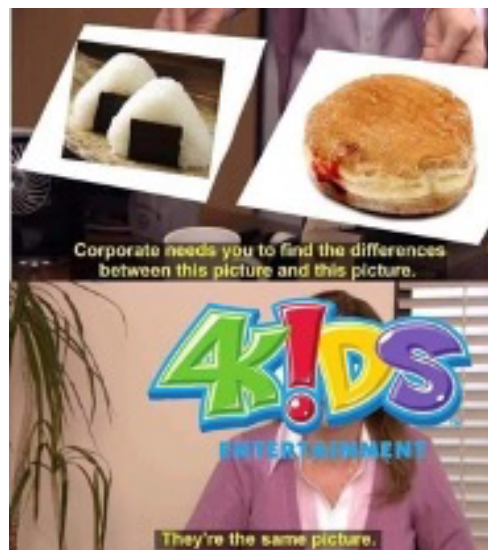
Figure 2. “Nothing beats a jelly-filled donut.”

For instance, Figure 2 shows an instance of the “They’re the same picture” meme, a simple two-panel format that parodies a scene from the popular NBC sitcom The Office in which an employee presents another with two identical images but claims that there are several differences (Lieberstein & Blitz, 2011). The meme format is often used to compare two similar objects. Here, the meme is critiquing 4Kids Entertainment, the company that produced the English dubs of the Pokémon (Grossfeld, Kahn, Kenji, Kenny, & Tsunekazu, 1997–present) anime for American audiences. In the original scene, the characters eat several rice balls, but in the English scene, the audio was dubbed as “jelly-filled donuts” despite the animation remaining unchanged (Atsuhiro & Shigeru, 1998). This particular meme instance requires significant context to understand it. Its humor arises more so from the references and cultural context and not necessarily from the specific visual elements of the image. Thus, high quality and high fidelity are not necessarily important for comprehension because the hastily edited image components are recognizable enough for many viewers.