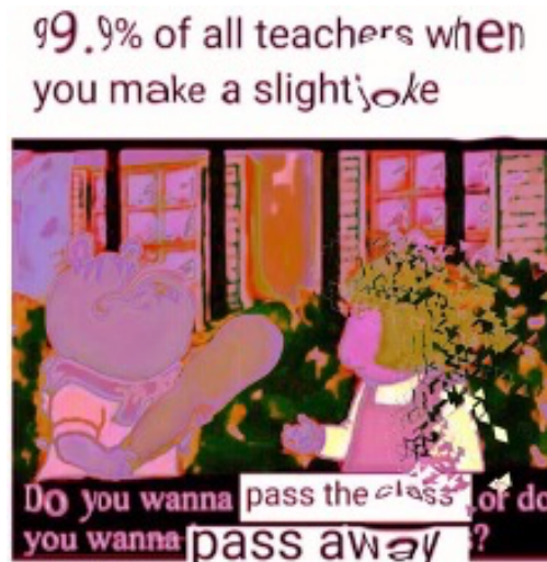
Figure 8. "Good Enough?"

/r/nukedmemes , on the other hand, goes in the other direction and contains images that have been significantly destroyed, almost to the point of incomprehensibility, as in Figure 8. For this subreddit, "Just adding a saturation filter and noise in paint.net isn't enough. Crank everything up and layer jpegs on top of each other or whatever. Text should be almost illegible or completely illegible or make no sense" ( /r/nukedmemes , n.d.). "Nuked memes" represent the destruction of an image for the sole purpose of destruction. Rather than image degradation being something that could be overlooked, it instead becomes the primary defining aspect of a specific community.