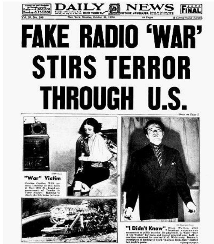
Figure 4. The New York Daily News front page, October 31, 1938.