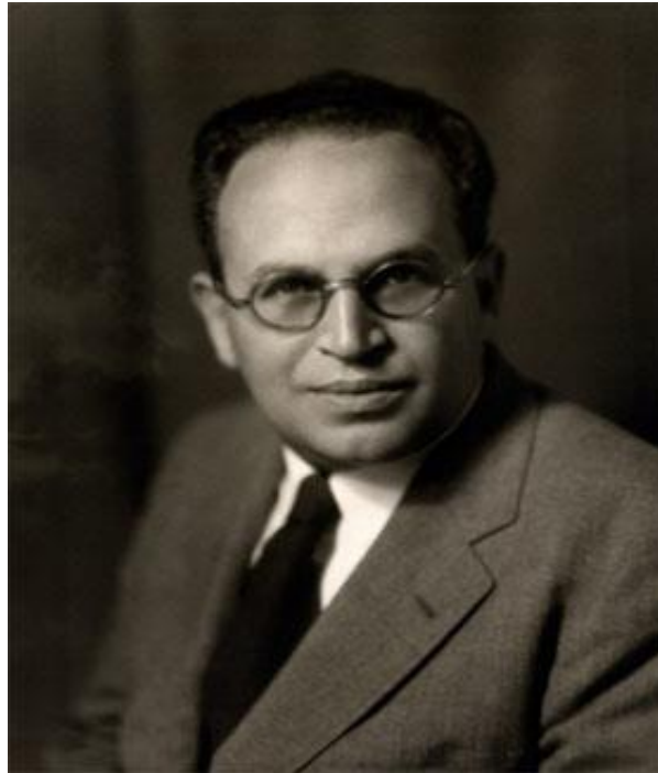
Figure 3. Paul Lazarsfeld. Released by Bardwell Press to promote the biography and collected research articles of Lazarsfeld.