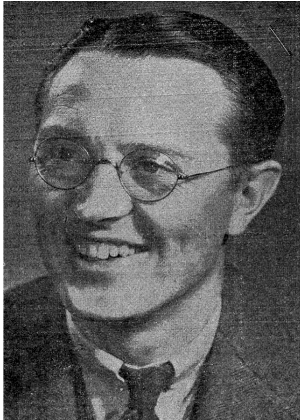
Figure 2. Hadley Cantril.

Cantril (1906–1969) was an ambitious, 30-year-old psychologist at Teachers College, Columbia University, set to join Princeton's psychology department in the fall (see Figure 2). He had studied with Gordon Allport as an undergraduate at Dartmouth and followed Allport to Harvard to pursue doctoral studies in 1930. While at Harvard, Cantril and Allport conducted a series of radio listening experiments, which formed the core of their 1935 collaborative book, The Psychology of Radio .