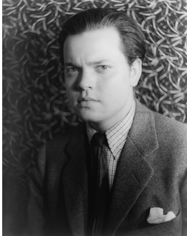
Figure 1. Orson Welles, March 1, 1937.

stage, while Lazarsfeld's Bureau work— Personal Influence especially—is positioned as exemplar of the second (e.g., Baran & Davis, 2011, pp. 136–139; Fourie, 2001, pp. 294–296; Giles, 2003, pp. 14–16; Perry, 2001, pp. 19–22; Sparks, 2012, pp. 57–61). 1