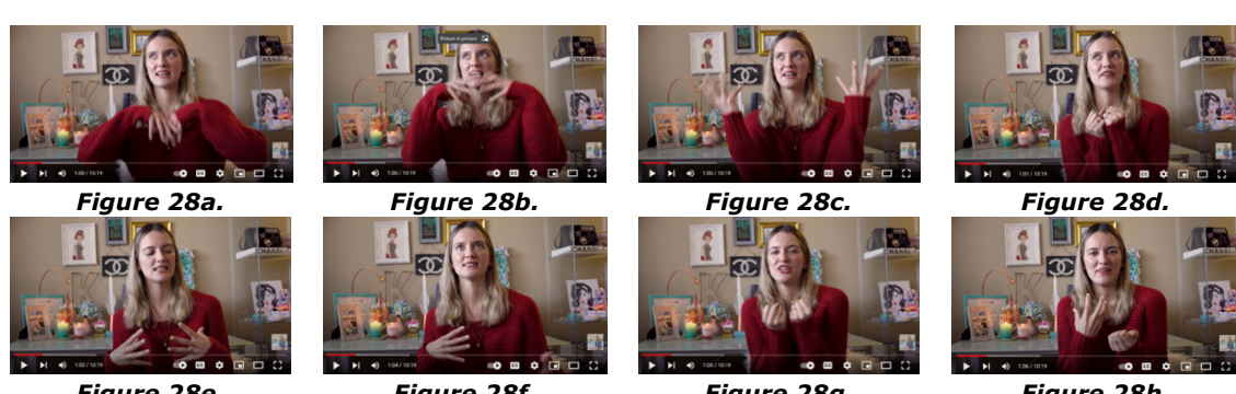
Figure 28e. Figure 28f. Figure 28g. Figure 28h. Figure 28 (a-h): Screenshots from video by Vestergaard (2018). (a) Vestergaard (2018, 00:01:00); (b) Vestergaard (2018, 00:01:00); (c) Vestergaard (2018, 00:01:01); (d) Vestergaard (2018, 00:01:01); (e) Vestergaard (2018, 00:01:03); (f) Vestergaard (2018, 00:01:04); (g) Vestergaard (2018, 00:01:05); (h) Vestergaard (2018, 00:01:06).