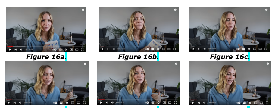
Figure 16d. Figure 16e. Figure 16f. Figure 16 (a-f): Screenshots from the video by Use Less (2019). (a) Use Less (2019, 00:01:04); (b) Use Less (2019, 00:01:05); (c) Use Less (2019, 00:01:08); (d) Use Less (2019, 00:01:12); (f) Use Less (2019, 00:01:15).