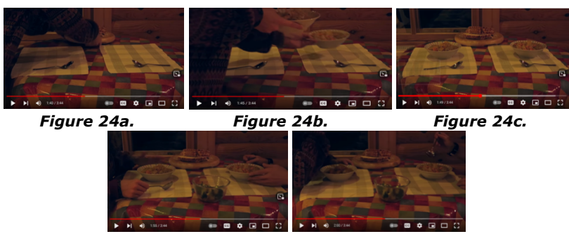
Figure 24d. Figure 24e.