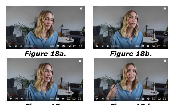
Figure 18c. Figure 18d. Figure 18 (a-d): Screenshots from the video by Use Less (2019). (a) Use Less (2019, 00:01:39); (b) Use Less (2019, 00:01:40); (c) Use Less (2019, 00:01:44); (d) Use Less (2017, 00:01:48).