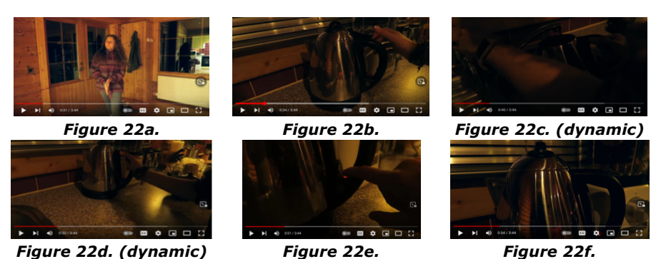
Figure 22d. (dynamic) Figure 22e. Figure 22f. Figure 22 (a-f): Screenshots from the video by Living the Life You Love (2017). (a) Living the Life You Love (2017, 00:00:31); (b) Living the Life You Love (2017, 00:00:34); (c) Living the Life You Love (2017, 00:00:40); (d) Living the Life You Love (2017, 00:00:50); (e) Living the Life You Love (2017, 00:00:51); (f) Living the Life You Love (2017, 00:00:54).