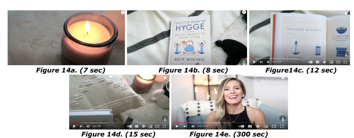
Figure 14 (a-e): Screenshots from the video by Dinen (2017). (a) Dinen (2017, 00:00:00); (b) Dinen (2017, 00:00:07); (c) Dinen (2017, 00:00:11); (d) Dinen (2017, 00:00:35); (e) Dinen (2017, 00:00:42).