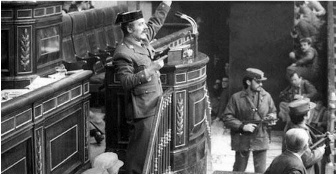
Figure 1. Lieutenant Colonel Tejero at the Spanish Congress (Pujol, 2011).

Consequently, the event's quick resolution is greatly attributed to Juan Carlos I, even if other interpretations have remarked the 23F ambivalences and several unknown facts (Campos Domínguez & Martín Jiménez, 2011; Jünke, 2016).