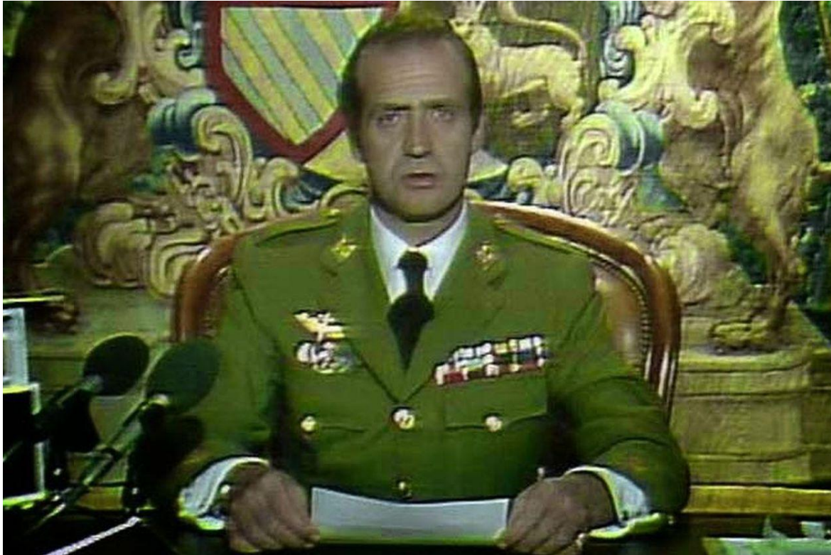
Figure 2. King Juan Carlos I in the televised speech defending democracy.

After the coup was aborted, a trial started. Ultimately, 29 military officers and a civilian were condemned to prison sentences, including Tejero and General Alfonso Armada, King Juan Carlos I's preceptor while he was the crown prince during Francoism. This fact fueled a series of conspiracy theories about the involvement of the king in the attack—so far, the evidence of 23F.