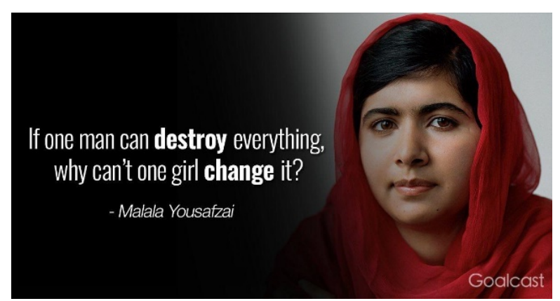
Figure 3. A collected #MeToo meme from Twitter that pictures Nobel Peace Laureate Malala Yousafzai.