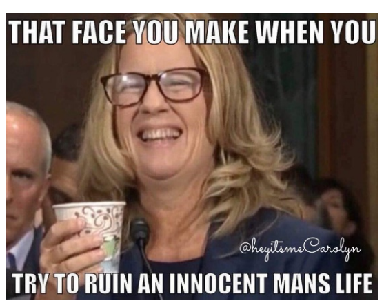
Figure 8. Examples of the most retweeted anti-MeToo Twitter memes using the pathos appeal.