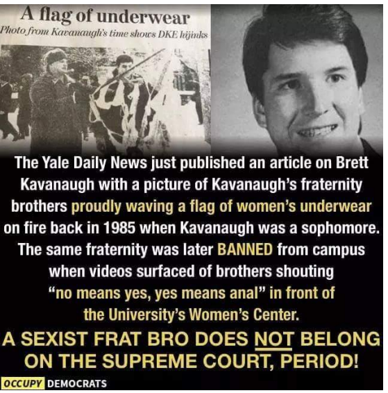
Figure 5. An example of collected #MeToo memes from Twitter that uses logos.