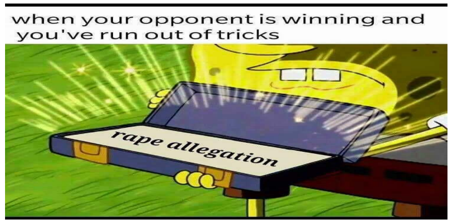
Figure 7. An example of collected #MeToo memes from Twitter uses pathos as a persuasive technique.