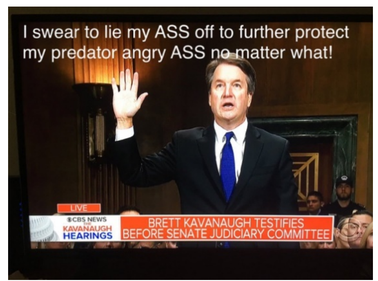
Figure 2. A collected #MeToo meme from Twitter that uses contrasting visuals and textual information.

This variable was coded based on whether the overlaid text matched the picture in the meme. Each meme was coded as complementary or contrasting. Figure 2 shows an example of contrasting visual and textual information. Memes that did not fit into these two categories were coded as not applicable.