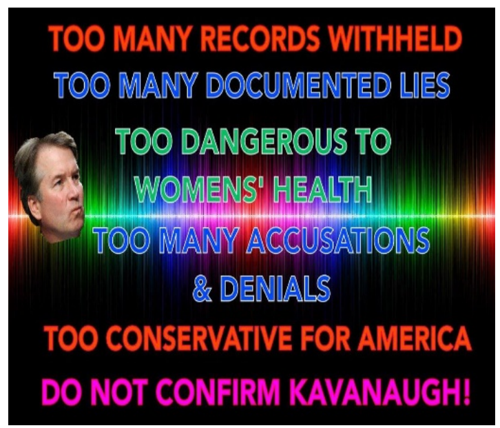
Figure 1. An example of collected #MeToo memes from Twitter that is text-dominant.

Each meme was coded as picture-dominant, text-dominant, or equally dominant. To be coded as visually dominant, a meme's message needed to be communicated primarily through the visual. To be coded as text-dominant, the meme needed to be heavily dependent on text (see Figure 1). Memes that depended on both the picture and the overlaid text equally were coded as equally dominant.