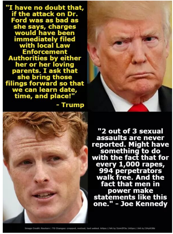
Figure 6. An example of collected #MeToo memes from Twitter that uses logos as a persuasive appeal.

The persuasion technique variable measured here was based on the meme's dominant mode of persuasion. Although the ethos technique was prominently used in #MeToo Twitter memes overall, this technique dominated only 8.4% of the memes in our sample. Furthermore, our analysis suggests that the ethical appeal was used less prominently in antimovement memes (2.5%) than promovement memes (5.9%). Together, these results suggest that anti-MeToo memes focused most on the emotional appeal (see Figure 7) and less on the logos and ethos appeals than pro-MeToo memes.