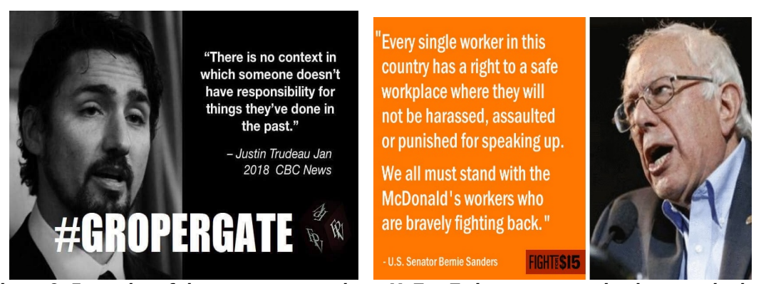
Figure 9. Examples of the most retweeted pro-MeToo Twitter memes using logos and ethos appeals.

The main contribution of our study does not lie so much in identifying the persuasion appeals used, but in revealing a deeper issue pointing to differences in the techniques that framed the tone of the MeToo movement on Twitter. A large portion of our study focused on unpacking the various modes of persuasion used in the #MeToo meme culture. Guided by previous literature, we argue that the dominant mode of persuasion used allowed for additional insights into how the MeToo movement was framed in viral memes and, in doing so, become tools to promote awareness about this movement.