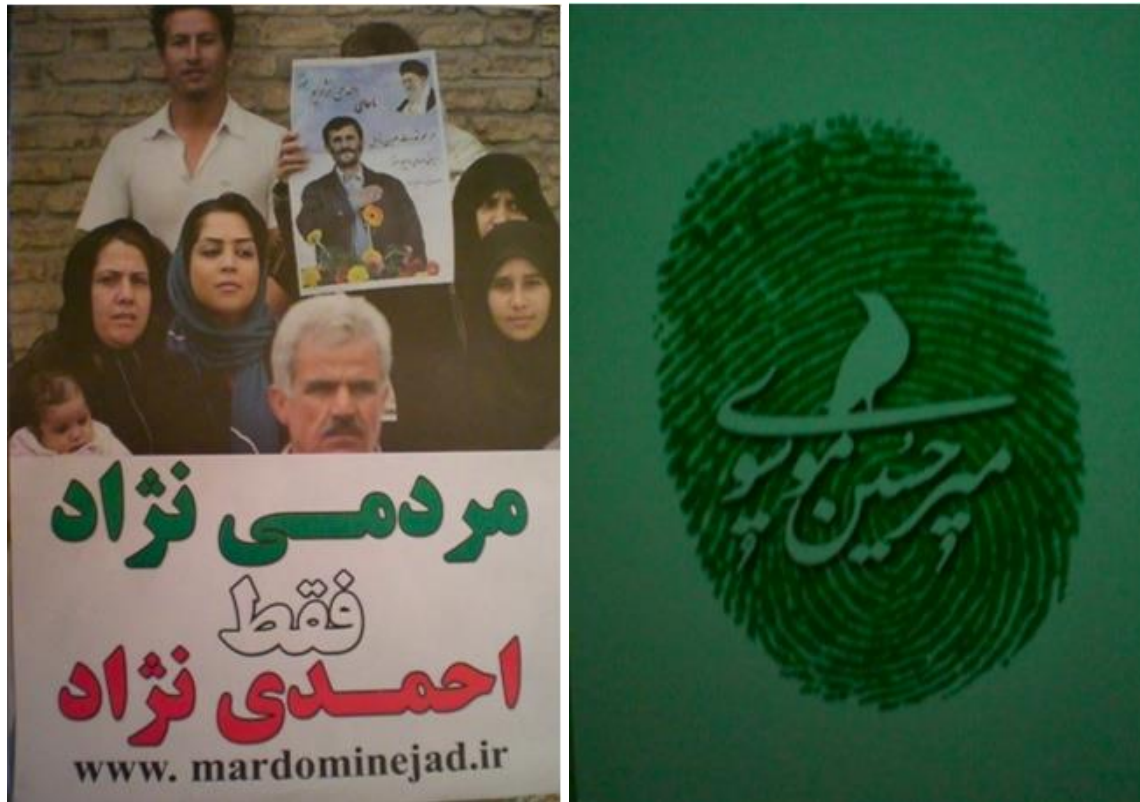
Figures 2 and 3. Campaign posters: Ahmadinejad (left, translation: The Populist, only Ahmadinejad ). Mousavi (right, translation: Mir Hossein Mousavi ).

The campaign to bring people out did work, and people came into the streets—to the government’s dismay, because they came out to express their demand for change. In fact, it became clear that “the people” that the government had in mind was not the umma (the community of believers), nor democratic voters, but voters who affirm the will of the leader rather than electing their own candidate. If there were any ambiguity before about this, the government’s reaction to the protest resolved it. As Manoukian (2010) suggests, “crowds” become both the site of the process of this disambiguation and yet at the same time are mobile and heterogeneous.