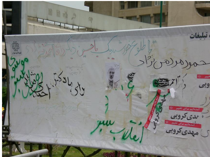
Figure 1. Campaign bulletin board provided by city hall.

Populist themes were central to the initial visual campaigns of the two main rivals. Ahmadinejad (the incumbent) used a socialist-realist-styled poster, while Mousavi (the opposition leader) from the beginning tried to revive themes from the 30-year-old Islamic revolution, fighting the tyrant through the story of the self-sacrifice of the third Shiite imam. Mousavi's first name, Mir Hossein, became synonymous with Imam Hossein. It was common to hear "Mir Hossein ya Hossein!" in public gatherings of Mousavi supporters. ( Mir refers to kinship with the Prophet Muhammad, similar to Seyyed , descendent of the prophet. Therefore, in this slogan, Mousavi's situation is equated to Imam Hossein and his fight for justice.