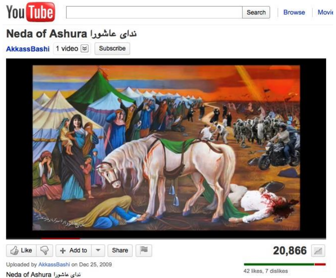
Figure 5. Screen shot of digital collage of Neda Agha Sultan in the story of martyrdom of Imam Hossein.

The original is a popular rendition of a late-19th-century depiction of the Karbala event. In this image, Zuljinah, the horse of Imam Hossein, returns to the imam's household camp without the imam. Available at http://www.YouTube.com/watch?v=Mv9ehsW6PN8&feature=player_embedded# . Other artists, such as Shoja Azari (Kino, 2010) have used a similar collage style to liken the event of 2009 to that of Karbala in the seventh century.