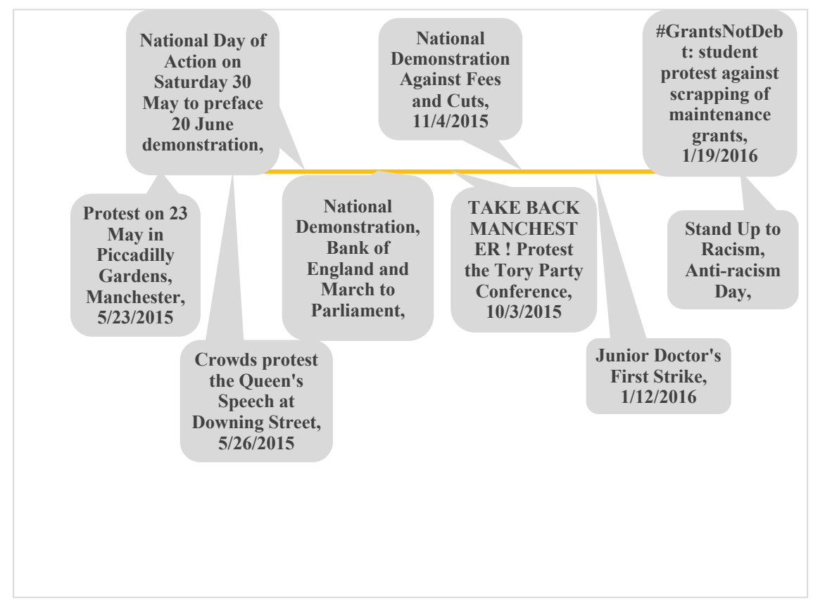
Figure 1. People's Assembly Protest Timeline (May 2015–January 2016).

In this investigation, we processed the data for both descriptive quantitative and qualitative analysis. In Mercea and Yilmaz (2018), a social network analysis was carried out to identify authors whose retweeted messages helped broker the Assembly's network. A fast-greedy modularity algorithm for network community detection in "igraph," the R social network analysis package, generated 24 retweet subgroups. The retweets linking those groups were analyzed with the latent Dirichlet allocation (LDA) natural language processing algorithm, which produces a probability distribution of words clustered into topics. These methods yielded a global perspective on the communication among subgroups in the Twitter network of the Assembly.